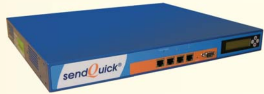
sendQuick ConeXa 300 Advanced Model (recommended up to 300 concurrent sessions)