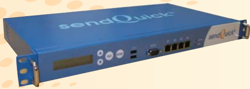
sendQuick ConeXa 100 Entry Level Model (recommended up to 100 concurrent sessions)